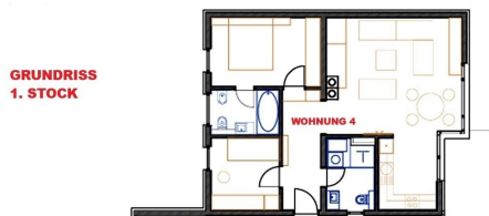
GRUNDRISS 1. STOCK